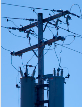
Electric Capacity by Fuel Source MW